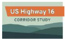
Potential Phasing Between Interchange and Corridor Projects Moon Meadows Drive to Section Line Road US16 Corridor Study